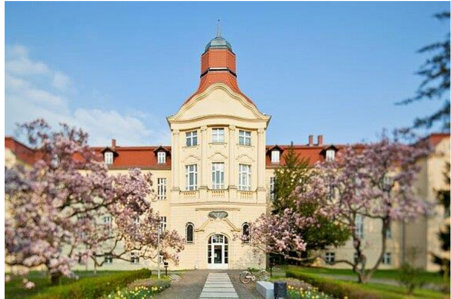
German Red Cross Headquarter in Berlin